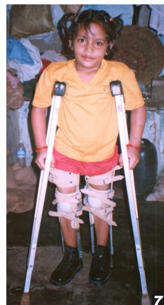
6. Her legs now straight after successful treatment. 7. Moving around freely with caliper and crutches.