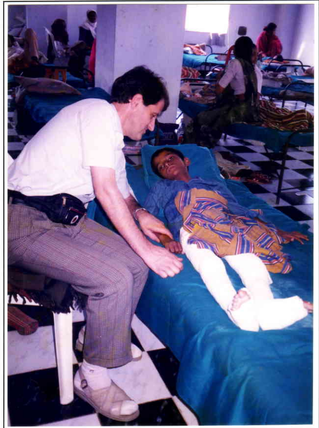
Caring for him at the Polio-Camp